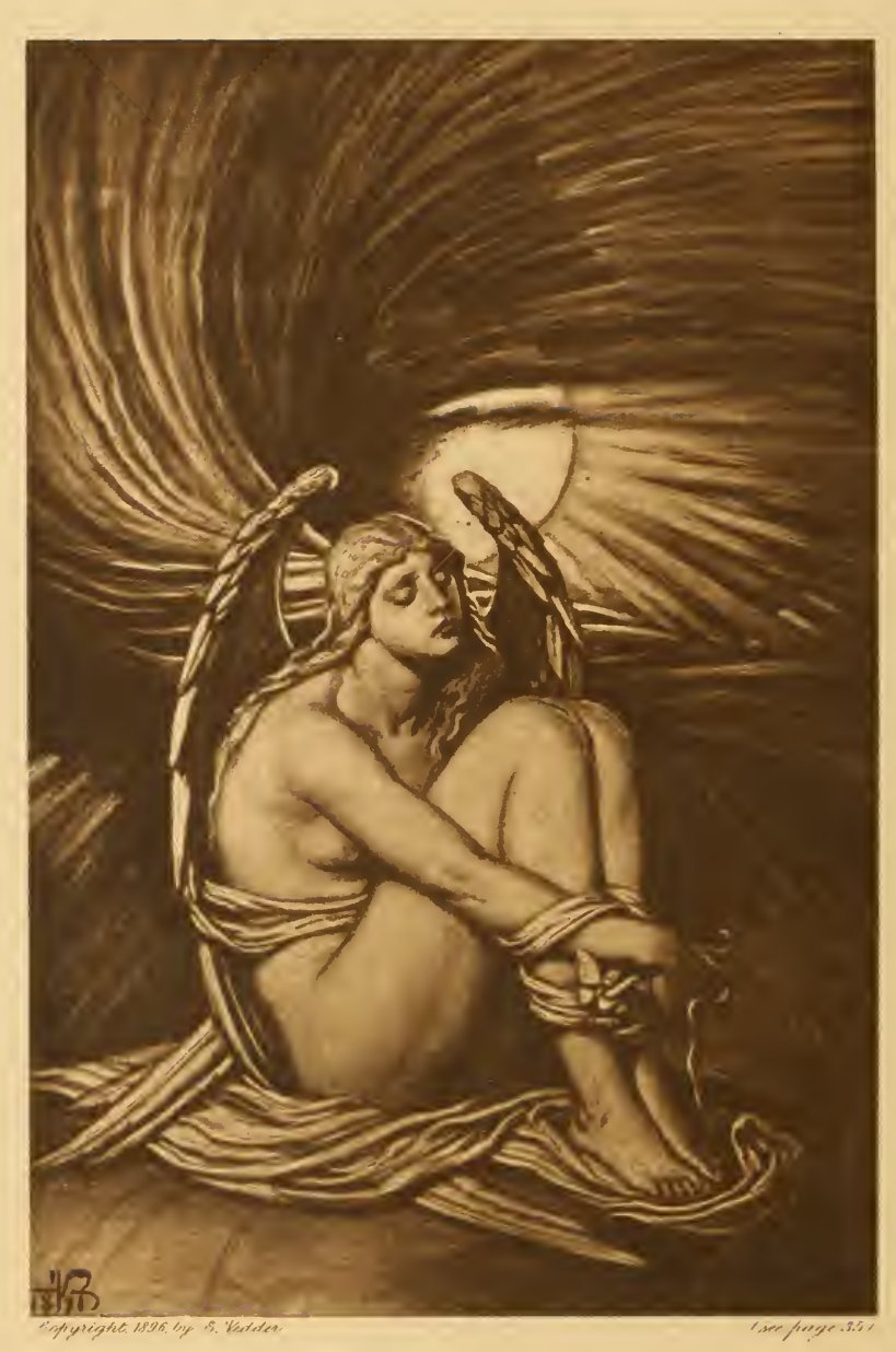
The Loub in Bondage